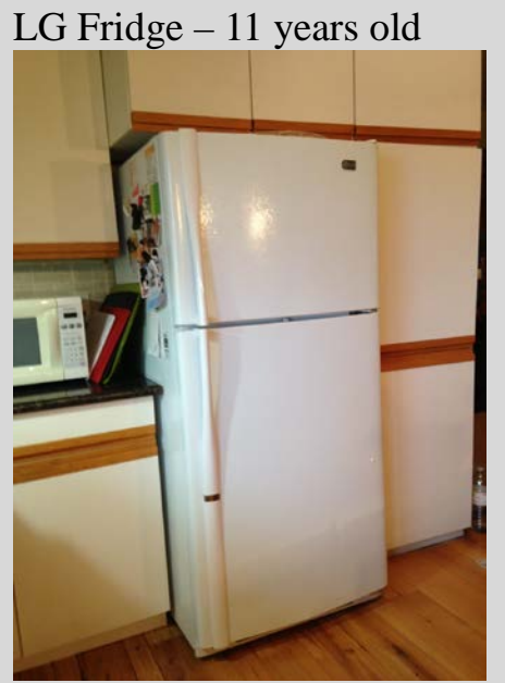
3 drawer, fridge / freezer

Excellent condition Serial # 304MR001 4G