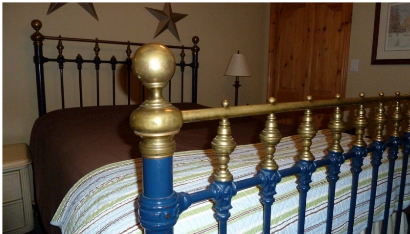
Cast Iron & Brass Double Bed $300.00