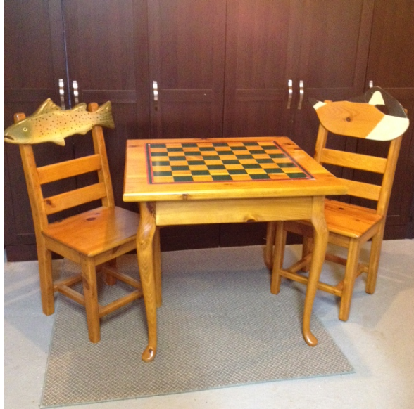
Pine Checker board table and Chairs $150.00