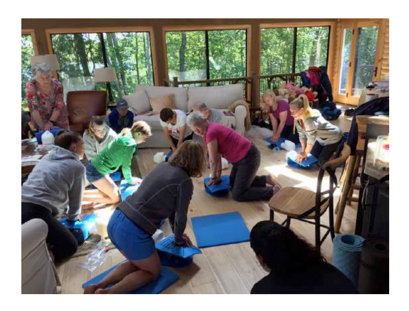
AED: Automated External Defibrillator

Please be advised that we have a defibrillator on the lake. It is located at: 2839 Southwood Road,