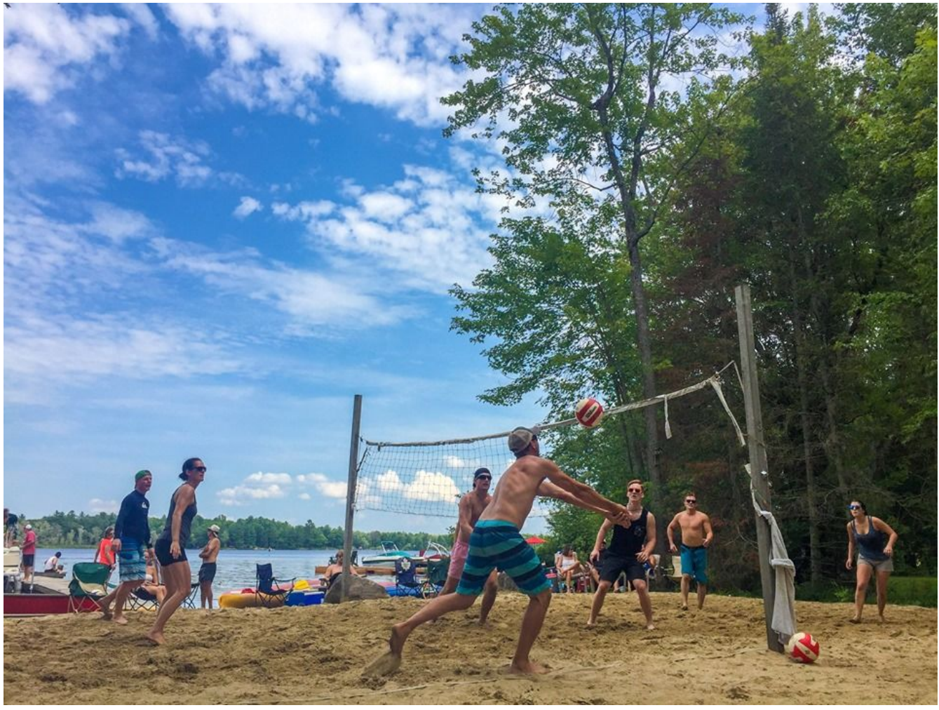
HAVE A GREAT LONG WEEKEND, MORRISON LAKE!